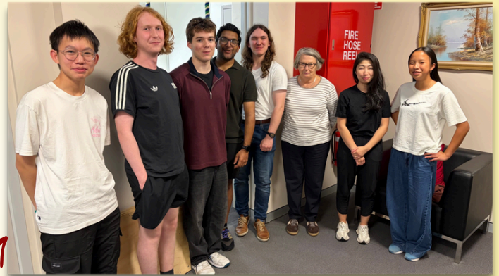
Most of our bellringers (a couple were not there) last Sunday during the weekly Sunday afternoon practice and pre-Mass ringing.